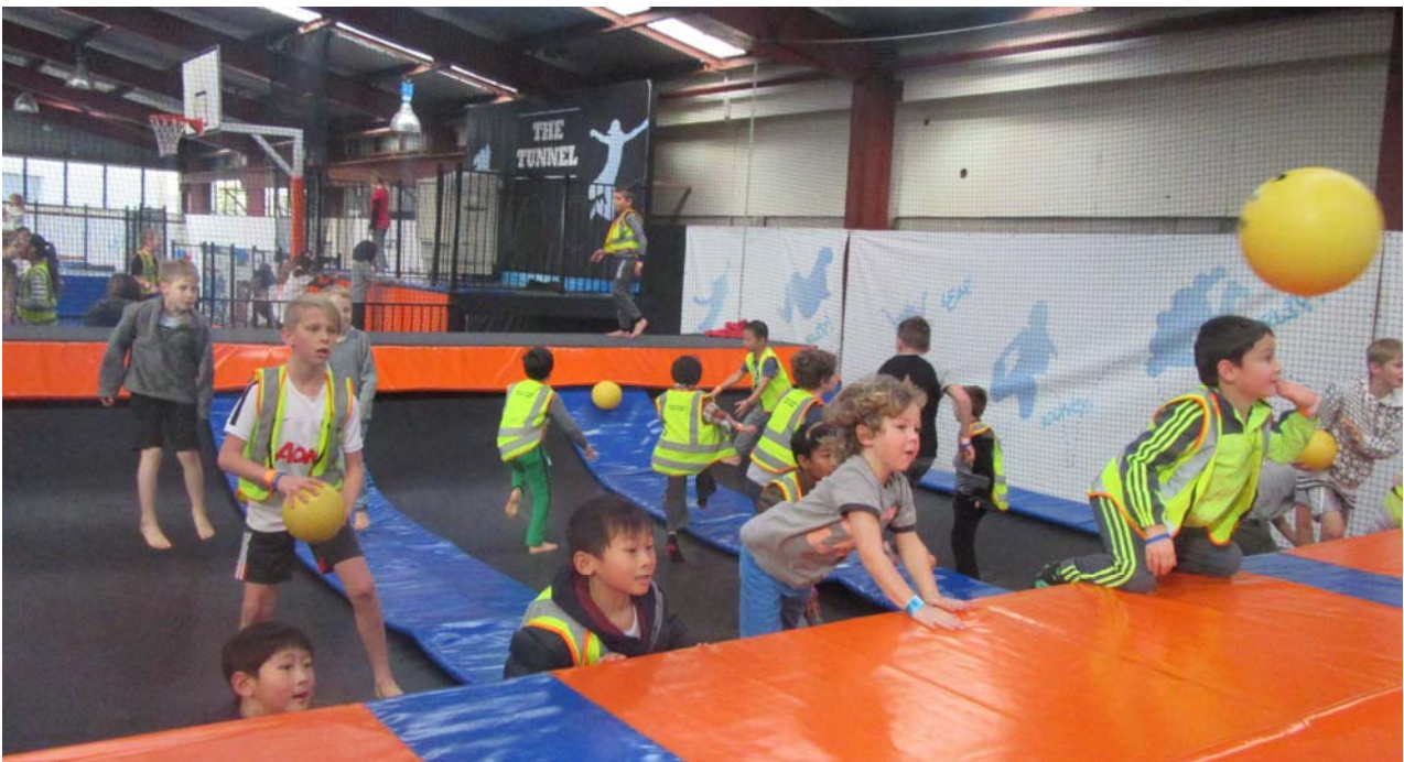
Parnell Trust offers a range of up to four different activity options every day of the school holidays. Adventure Seekers have exhilarating adventures out and about in the Auckland area, such as this day's action at Gravity NZ Trampoline Park in Mount Wellington.

average number of children in Parnell Trust's After School Programmes every day