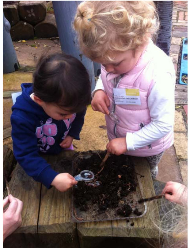
Children from Gladstone Park Early Childhood Centre investigate worms from the worm farm on their visit to Auckland Council's Zero Waste Zone.

The trip fitted perfectly with our centres' philosophy of sustainability and it was a wonderful chance for everyone to see the benefits of recycling first hand.