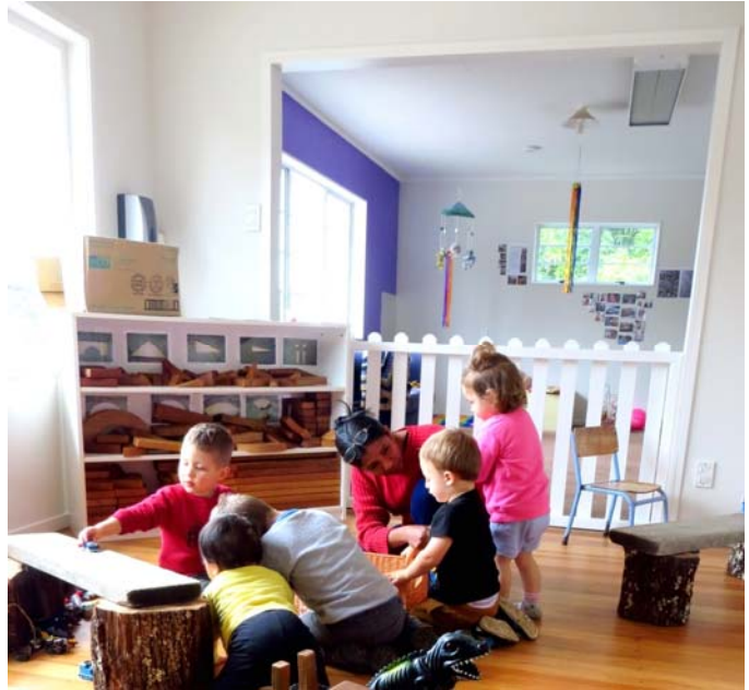
Extensive renovations to the newly-acquired St Johns Early Childhood Centre's building have created beautiful rooms for children to explore and learn in.

We have upgraded Gladstone Park Early Childhood Centre's outdoor area with new grass and drainage, and included a mud pit in the design for the children to get down and dirty. The children love it! Occupancy for the centre in 2017/18 is forecast to average 89%.