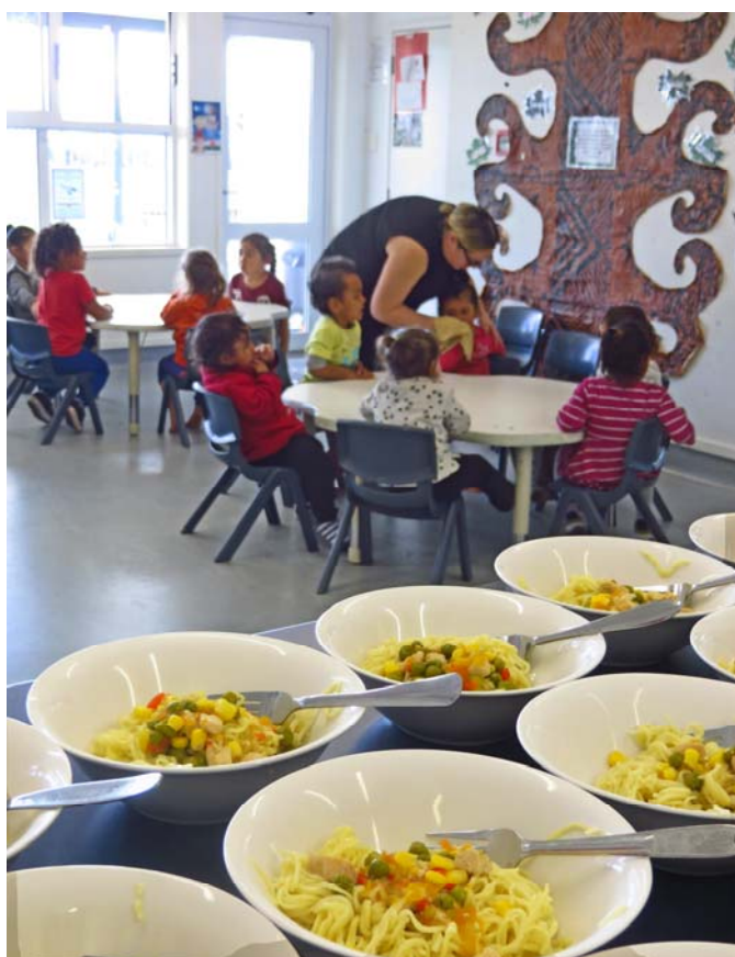
Children at Nga Homai Taonga Early Childhood Centre are loving their KidsHQ SuperMeals lunches. Teachers have found that the tamariki are not as hungry in the afternoon following their filling nutritious meal.

KidsHQ SuperMeals sold from Parnell Trust locations